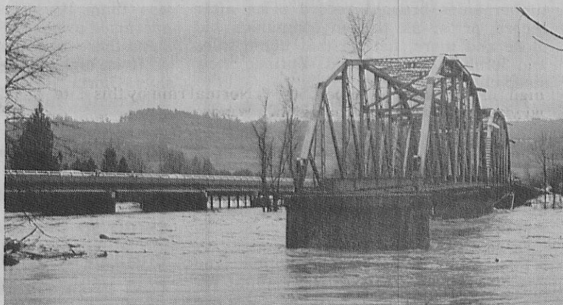
(Above) area roads were inundated during the Christmas storm of 1964, and at least one bridge (below) lost its approach to raging floodwaters