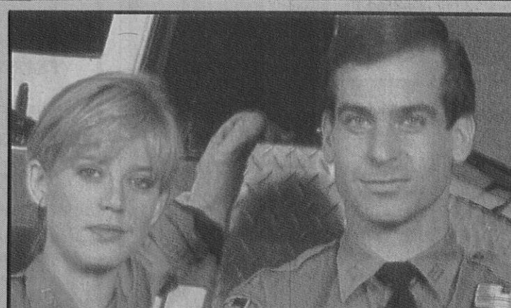
'True Blue' takes you where the action is — in TV Focus

Not everyone is getting more time off for the holiday however. The state-licensed Northgate Liquor store plans to open an hour early today, at 10 a.m., to handle the holiday rush.